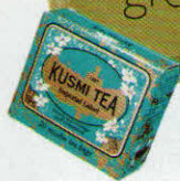
Kusmi detox tea, $16/20 bags; us.kusmitea.com/en/

In a Tufts University study of moderate exercisers, green-tea drinkers lost notably more belly fat than a control group who drank another caffeinated beverage. Make your own frozen bars from iced green tea at home.