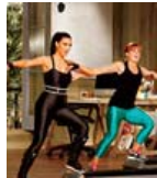
Moves on Demand: ExerciseTV Online