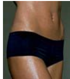
Emotional Eating: The Brain-Stomach Connection