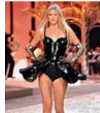
Weight in Hollywood: Is the Trend Changing?