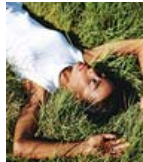
Happy Meals: Good-Mood Foods