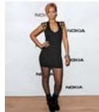
Body Image: Is Our Ideal Shifting?